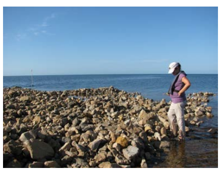
Figure 2. Oyster reef restoration

Oyster Reefs play a critical role in keeping estuarine habitats healthy for fish and wildlife. The project targets restoration of oyster reef habitat along 7.2 miles of degraded coastline and 52,000 acres of salt marsh and seagrass beds to improve ecosystem function and services, including estuarine freshwater entrainment, living shoreline enhancement and fishery habitat improvement. Local materials that have a proven track record in restoring oyster reefs will be used for restoration, making them more resilient to changes in freshwater flows (Figure 2).