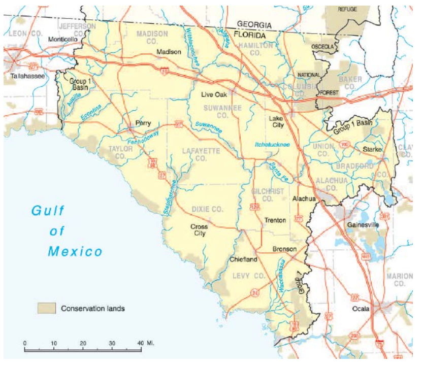
Figure 7. Suwannee Watershed

The Suwannee Watershed (Figure 7) covers more than 7,700 square miles in north central Florida within all or part of 14 counties. Portions of the basin extend into southern Georgia. It encompasses the Upper Suwannee, Lower Suwannee, Alapaha, Withlacoochee, Aucilla, Econfina–Steinhatchee, Santa Fe, and Waccasassa river basins.