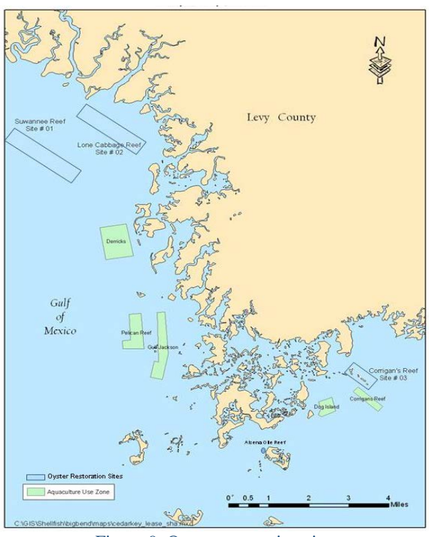
Figure 9. Oyster restoration sites

the Gulf of Mexico supports extensive economically important hard clam aquaculture activities located on state lands in designated high-density lease areas. The project is roughly centered on Cedar Key, Florida (29.141182°N, 83.029076°W). The locations of the individual oyster restoration sites are identified on the map that follows (Figure 9).