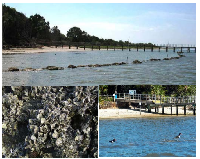
Figure 12. Atsena Otie oyster reef restoration

The pictures of the Atsena Otie oyster reef (Figure 12), nearby Cedar Key, Florida, were taken two years after project construction. Note oysters growing through the recovered clam bags and American oystercatchers