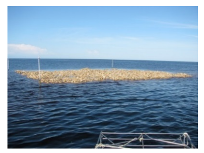
Figure 6. Oyster reef restoration

In the context of this restoration project, the most instructive outcomes for improving learning from oyster restoration come from two main areas. The first is critical evaluation of observed vs. expected outcomes, examining the response of oyster populations to restoration actions. An example would be measuring the resilience in terms of oyster population recovery on an oyster reef (once colonized) from a tropical storm event or period of high or low freshwater flows. Second, system level manipulations, where restoration actions alter wave action and salinity for thousands of hectares of nearshore habitats, can create very strong contrasts at a single location or across spatial gradients, thus maximizing learning opportunities at a scale that is pertinent to the Council's goals and objectives.