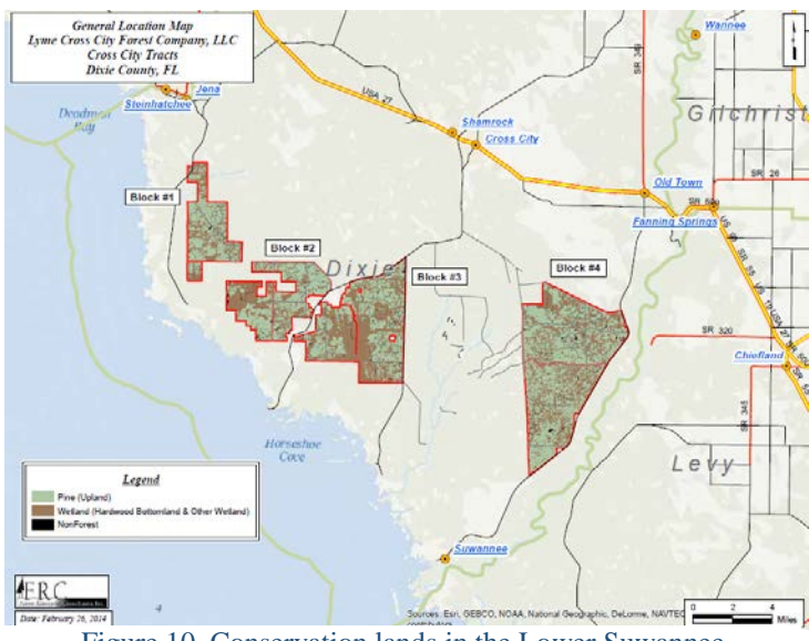
Figure 10. Conservation lands in the Lower Suwannee

The project is located in Dixie County, south of US 19 and Cross City, Florida. The 46,500-acre Lyme Cross City Forest Company, LLC ownership spans from the Steinhatchee River to the Suwannee River (Block #1-4 in Figure 10). The 5,800-acre parcel (Block #1) is adjacent to the Big Bend Wildlife Management Area close to the City of Steinhatchee. It also is close to the 32,000-acre California Lake Conservation Easement. acquisition of which was completed in 2001, and is directly adjacent to the Lower Suwannee National Wildlife Refuge. If all 46,500 acres are